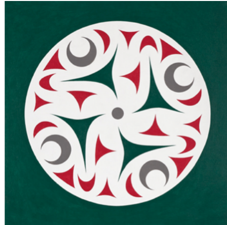
The Moon and the Pond