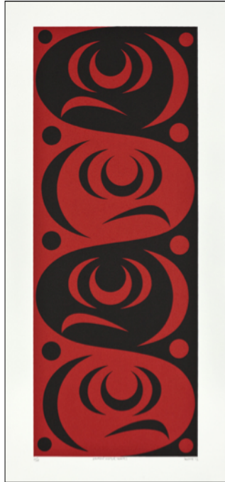
Salmon Water Waves