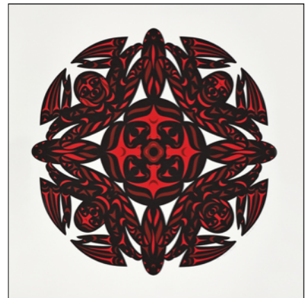
Behind Four Winds