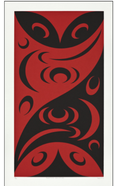
Redefining Each Other

View lessLIE's artist statements on our website.