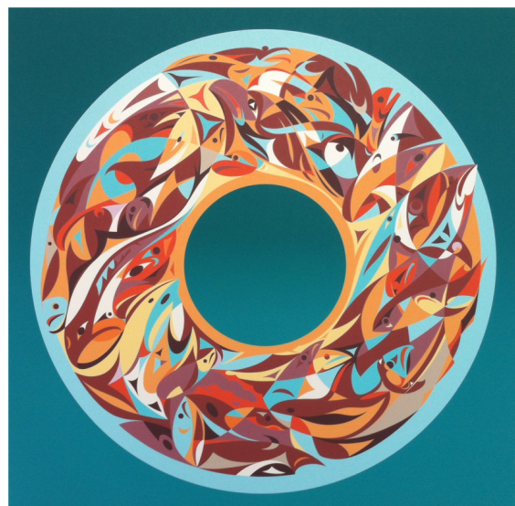
Beyond the Edge - 2015 - Edition of 110