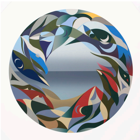
The Edge - 2009 - Edition of 120

Every aspect, particularly living beings on Earth are being impacted by our actions ... we each hold the world in our hands.